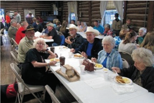
Several Black Forest AARP Chapter members join the large crowd for a hardy breakfast to start the day.

The Black Forest AARP Chapter 1100 celebrated the Black Forest Festival by selling homemade foods, crafts, & home grown potted plants from their AARP sponsored booth. The resulting $360.20 raised was all donated to the Black Forest Cares Food Pantry. Twelve chapter volunteers contributed to making & providing the items & they also staffed the booth on the Festival concourse.