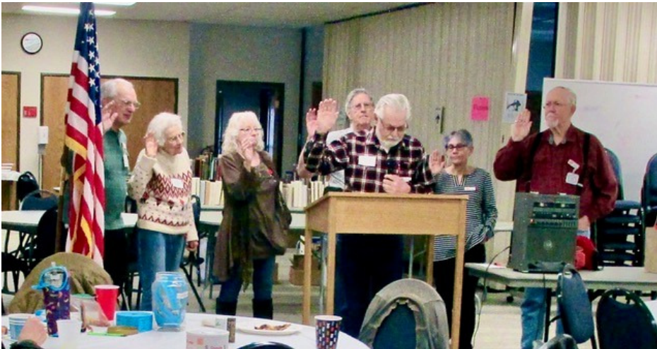
Installation of Chapter 2023 Officers.

◆ 2023 DUES must be paid by February 28 if you want to remain a Chapter member.