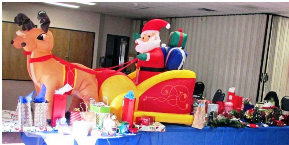
Santa & his sleigh bring

Individuals interested in doing community service, while having some fun, social activities, & lots of great food, should consider joining Chapter 1100. The annual dues are only $10 per person. All ages are welcome. For more information call Stan at 719.596.6787 or visit the Chapter web site at https://aarpchapter1100blackforest.weebly.com .