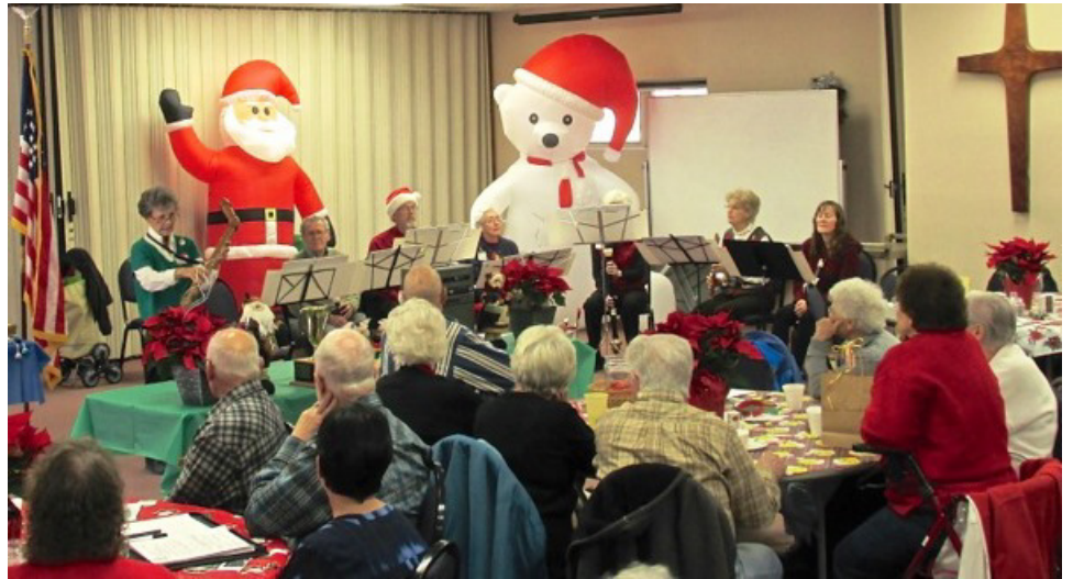
The Fermatas Recorder Group entertains the attendees with a program of Christmas music.