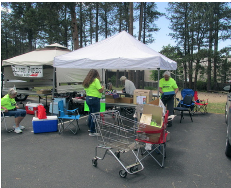
Volunteers were accepting donations for AARP Chapter #1100 and Tri lakes Cares. Eight hundred pounds of food was collected!