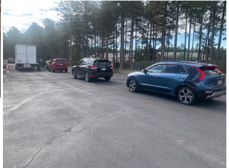
Cars started showing up at 8! There was a steady line the entire morning. Thank you to our community!