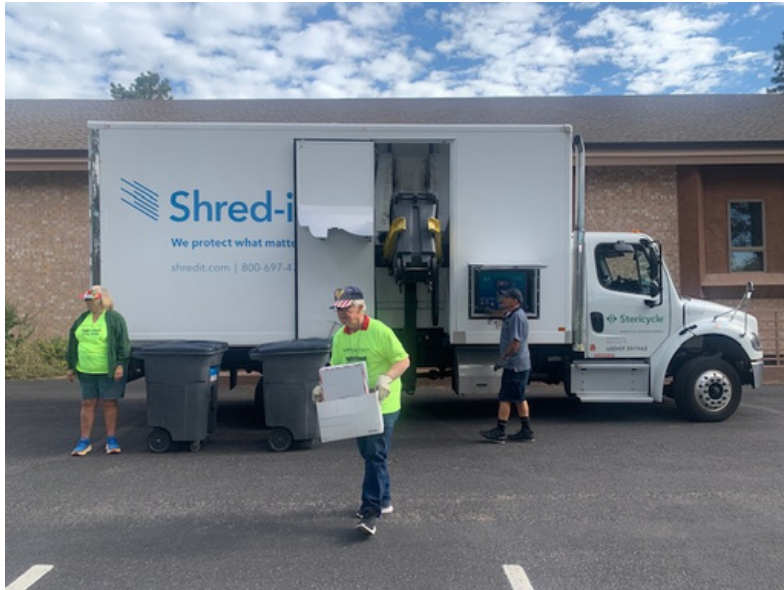
Shred-It arrived in time to start accepting at 8:45am. There was slight trouble as the truck was filled by 11:50am! We were able to continue to accept donations for Tri Lakes Cares.